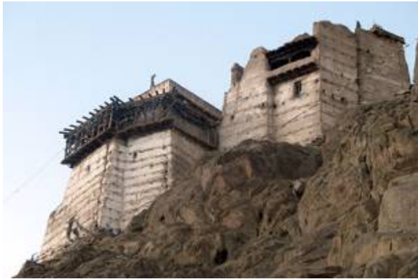
India, Ladakh, Leh – Castle