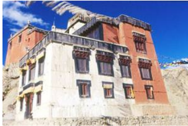
India, Ladakh, Leh – Tsemo Gumpa