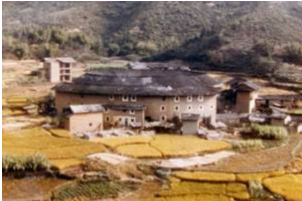
China, Fujian Province – Village / house of Hakkas clan