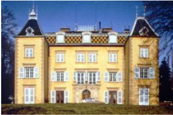
France – Château de Reyrieux, 19 th century