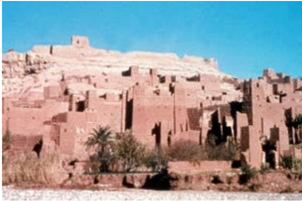
Morocco – Village in the North Atlas