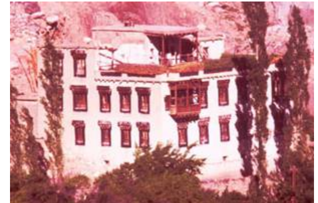
India, Ladakh, Basgo – House