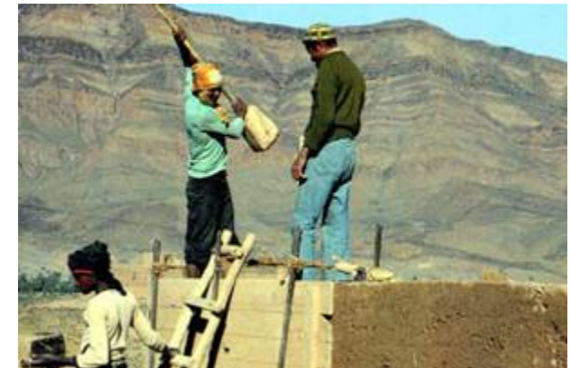
Morocco, North Atlas