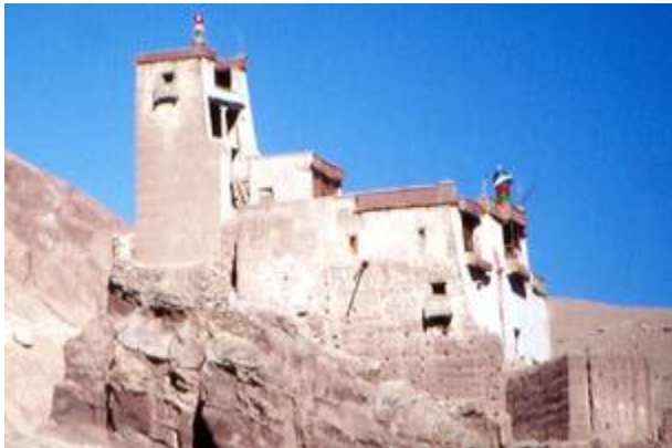
India, Ladakh – Basgo Gumpa