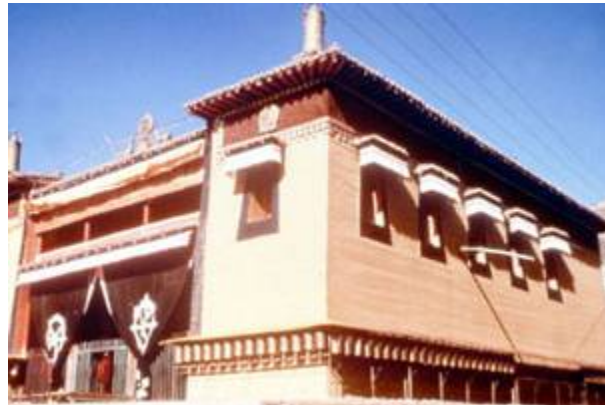
Tibet, Amdo – Rebkhung monastery