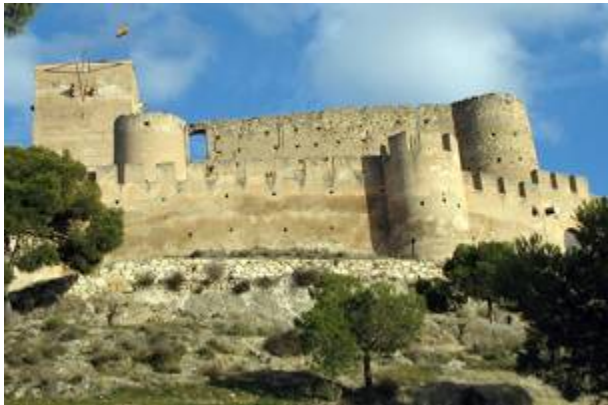
Spain – Castillo de Biar, 12 th century