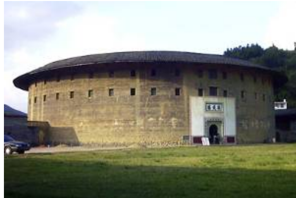
China, Fujian Province – Village / house of Hakkas clan