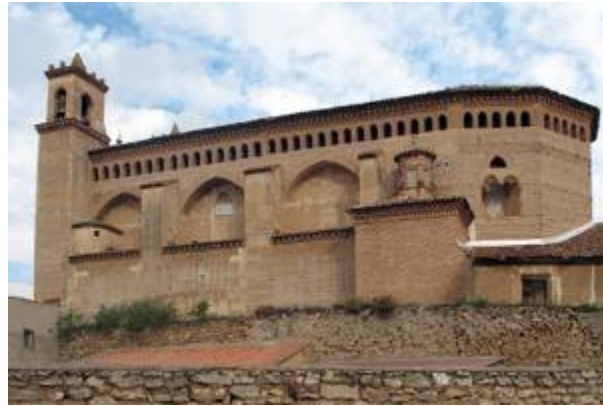
Spain, Maluenda – Church Santas Justa y Rufina