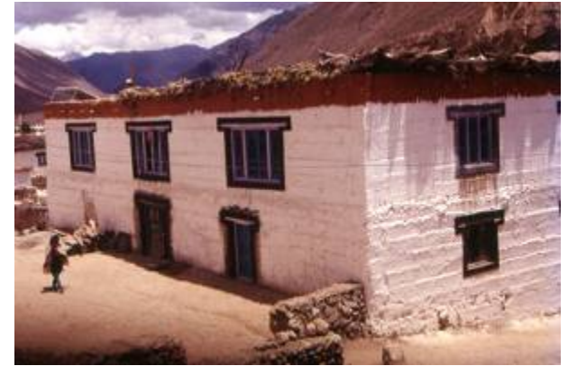
India, Spiti – Tabo village