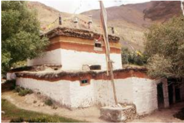
India, Spiti – Lalhung temple, 10 th century