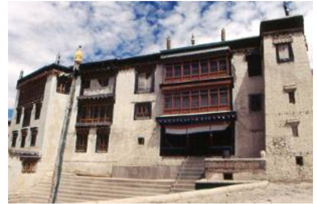
India, Ladakh – Spitik Gumpa