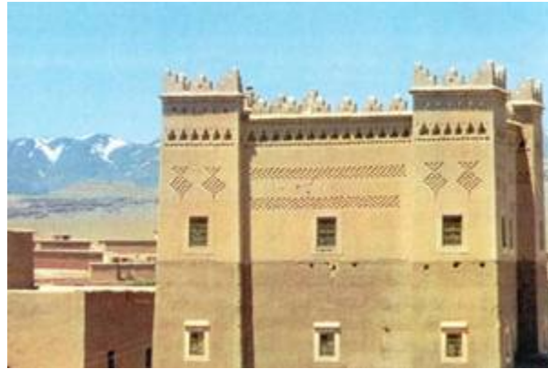
Morocco – House in the North Atlas