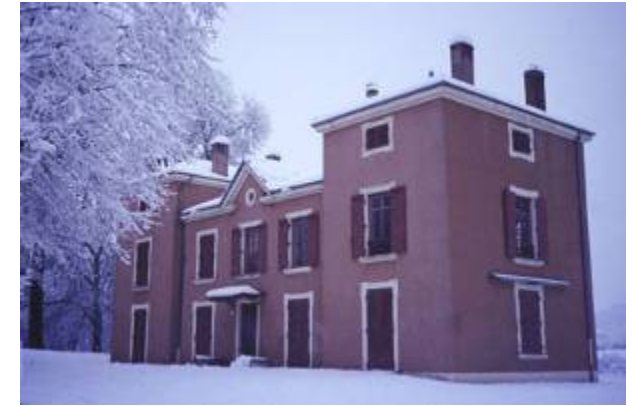
France, Villefontaine – Ex bourgeois' house