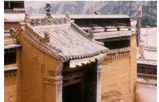
Tibet, Amdo – House