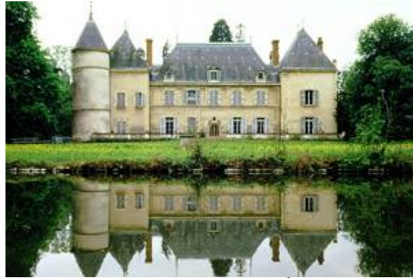
France, Dauphiné – Château, 19 th century