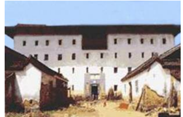
China, Fujian Province – Yijing Building at Shangyang