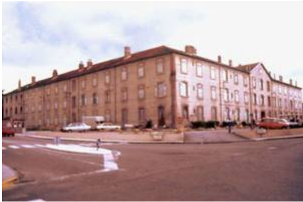
France, Saint Siméon de Bressieux – Longest building in Europe