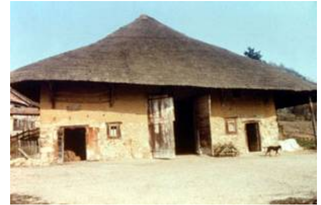
France, Charavines – Farm house