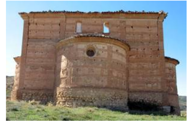
Spain, Villafeliche – Church