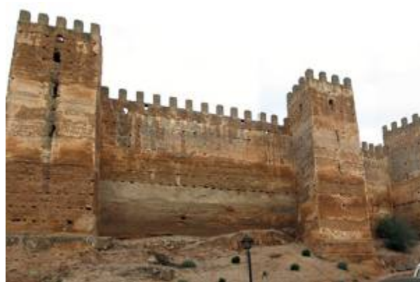
Spain – Castillo Baños de la Encina, 10 th century