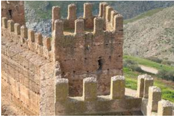
Spain – Castillo Baños de la Encina, 10 th century