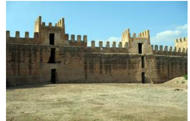
Spain – Castillo Baños de la Encina, 10 th century