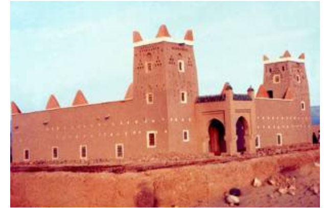
Morocco – House