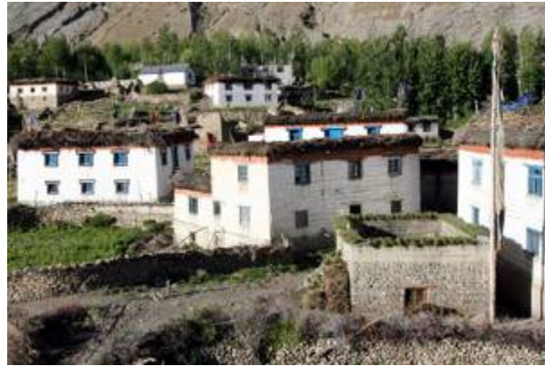
India, Spiti – Mane village