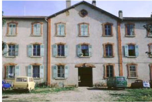
France, Saint Siméon de Bressieux – Social housing, 19 th century