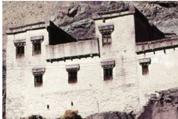
India, Ladakh – Basgo village