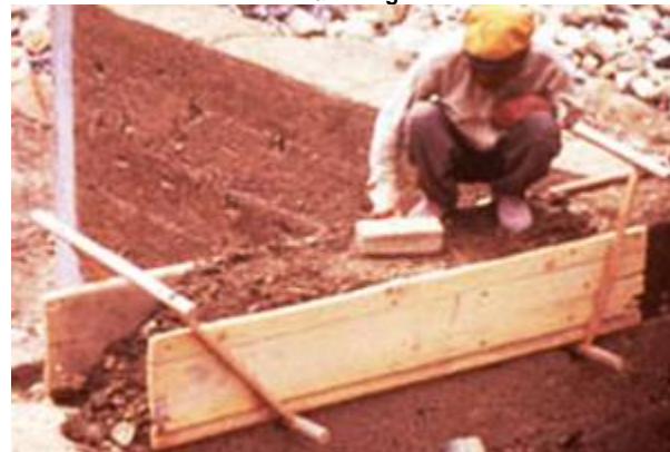
India, Ladakh, Losar

Once a course has been completed, the process goes on in the same way for the following courses till the maximum height of the panels. Immediately after completion, the formwork is removed and shifted either sideways in the case of the horizontal technique or lifted up for the vertical technique.