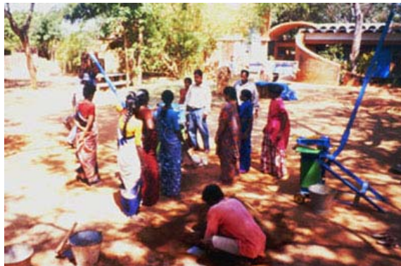
Production of CSEB for a women self help group