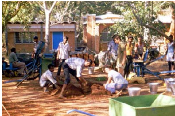
Production of CSEB since 1990

Five to eight training programmes of one week are regularly conducted every year at Auroville. They approach theory with basics on soil characteristics, design, calculation, etc. and practice with block making, quality control, design guidelines, etc. All skills are welcome: engineers or architects, technicians or supervisors, masons or students and laymen.