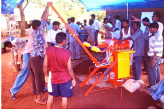
Production of interlocking CSEB for earthquake resistance