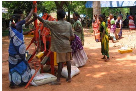
Production of CSEB for a women self help group