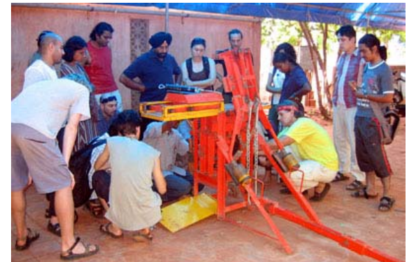
Adjustment and maintenance of the Auram Press 3000