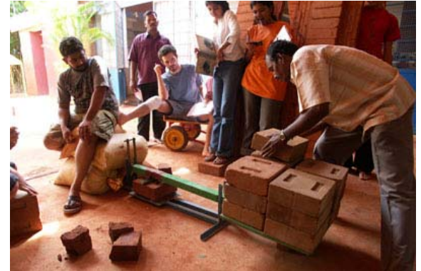
Session on quality control with the field block tester