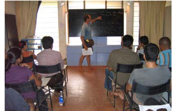
Theoretical lectures cost analysis