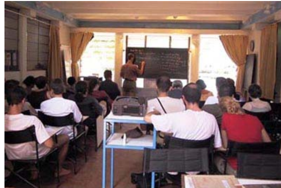
Theoretical lectures on soil identification