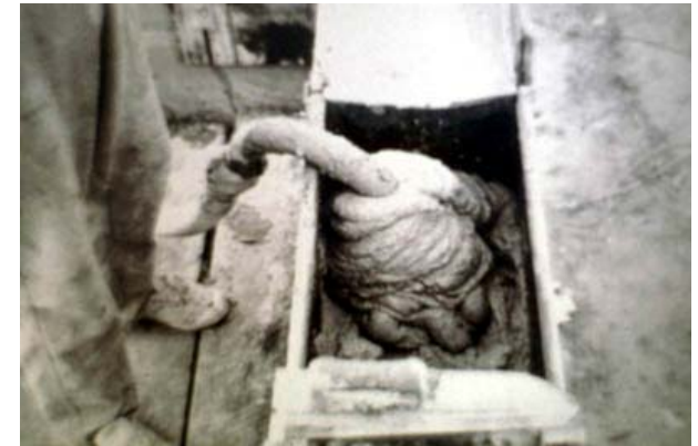
New Zealand