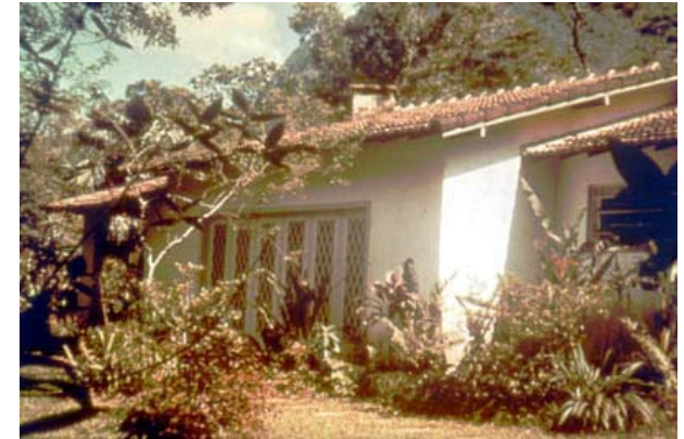
Brasil, Rio de Janeiro - 1949