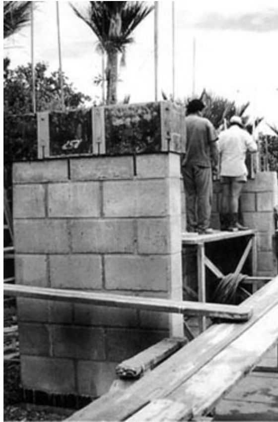
New Zealand