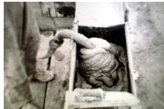
New Zealand