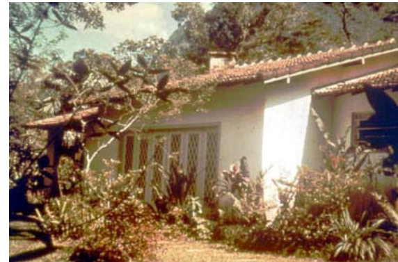
Brasil, Rio de Janeiro - 1949 (Photo Unknown)