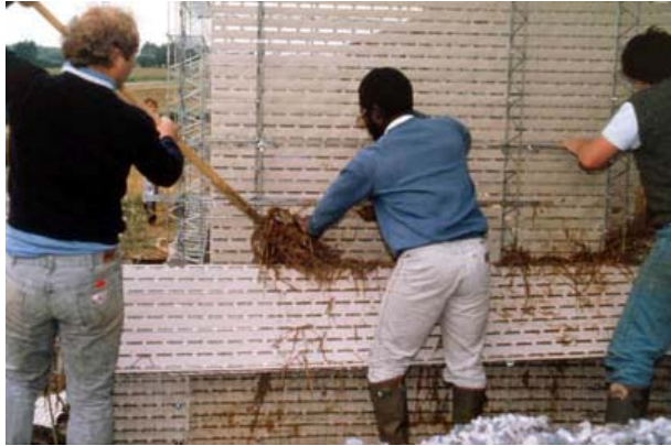
Belgium, Leuven

Very clayey soil, in a liquid state, is poured on straw, which has been chopped to the desired length. The mix is generally tamped afterwards into forms. These walls are not load-bearing: they are light, have a very high thermal insulation value and must be built in a wooden structure. It was traditionally used in Germany and was re-used for reconstruction after the 2 nd world war. It is mostly known with the name Straw clay. Straw clay can be used as a filler wall, formed between a wooden structure or as prefabricated blocks.