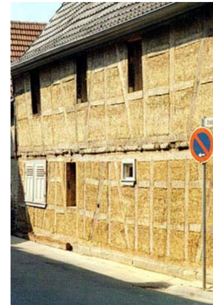
Germany, Hessen, Gross Gerau