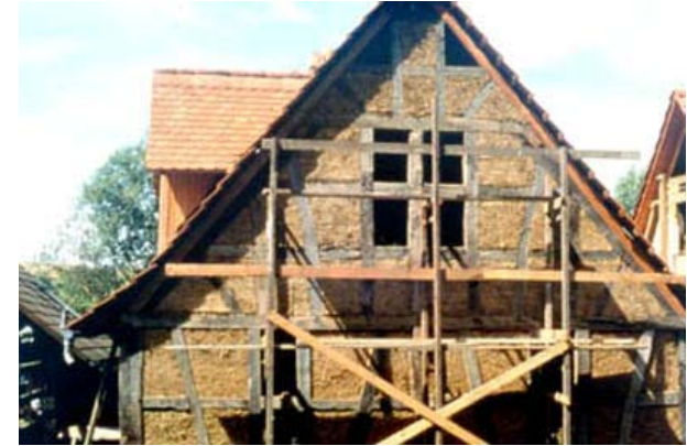
Germany, Darmstadt