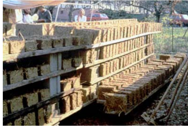
Germany, Darmstadt