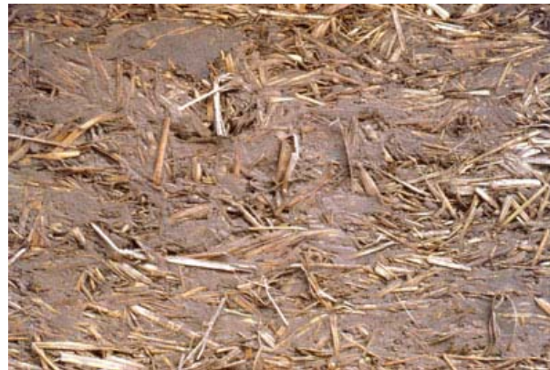
Belgium, Overisse