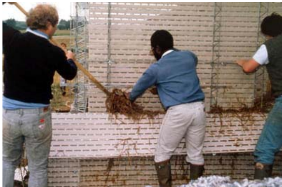
Belgium, Leuven

Very clayey soil, in a liquid state, is poured on straw, which has been chopped to the desired length. The mix is generally tamped afterwards into forms. These walls are not load-bearing: they are light, have a very high thermal insulation value and must be built in a wooden structure. It was traditionally used in Germany and was re-used for reconstruction after the 2 nd world war. It is mostly known with the name Straw clay. Straw clay can be used as a filler wall, formed between a wooden structure or as prefabricated blocks.