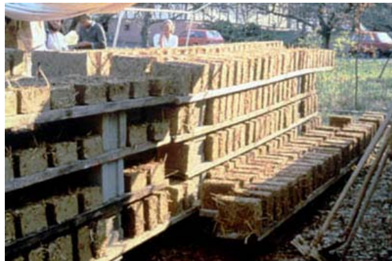
Germany, Darmstadt