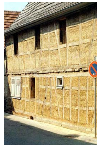
Germany, Hessen, Gross Gerau