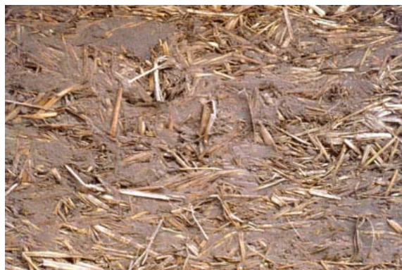
Belgium, Overisse