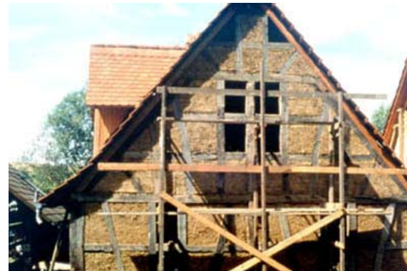
Germany, Darmstadt